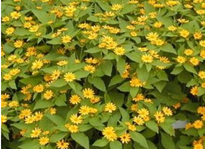
Creeping Zinnia as a ground-cover

Try them in a flower bed that gets full sun or in a spot where other annuals have collapsed from heat in the past. Dahlberg daisy . This is a low-growing annual. It has small, yellow flowers that cover the plant until the first freeze in the fall. Creeping zinnia ( Sanvitalia ). This is another low-growing ground cover type annual that fills in large areas quickly with yellow to orange, brown-centered flowers. Globe amaranth ( Gomphrena ). Amaranth reaches a height of 1 - 2 feet with red, pink, white, purple and yellow flowers shaped like a large clover. Great for using in dry flower arrangements. Annual statice . Statice comes in a wide variety of colors and is also great for drying. The flower bolts to about 18 inches, creating a spectacular show. Madagascar periwinkle (annual vinca). This works well