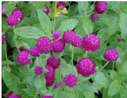
Globe amaranth blossoms

When we think of annuals, we normally think of areas with spectacular colors that bloom all summer. We also think of high water usage to keep them looking their best. However, this does not always have to be the case. There are many annuals that are considered low-water use plants that still thrive and give that abundance of colors even in a water-wise landscape. The following annuals thrive in hot, dry locations and are some of my favorites.