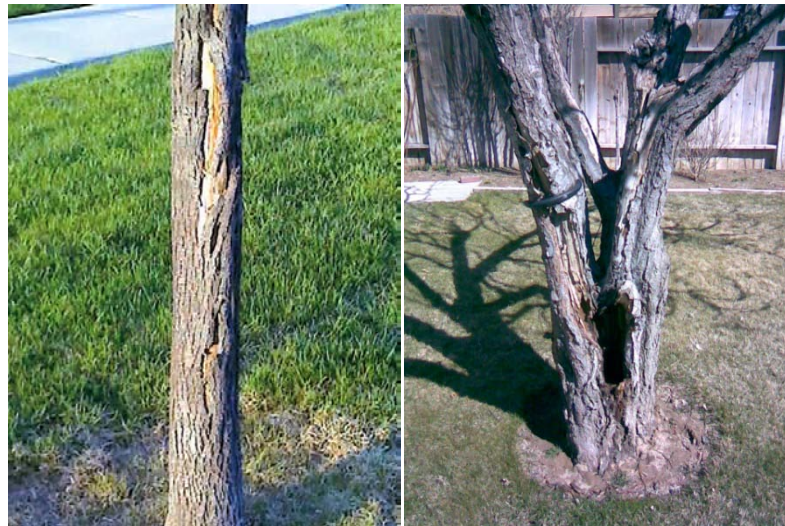
Examples of southwest winter injury.

Mention of an environmental disease called Southwest winter injury that is prevalent in Utah should be made. It occurs when bark on the south and west sides of a tree is exposed to the sun during winter months. This causes sap flow during the day. At night, this sap in the conductive tissue of the bark freezes and eventually causes cells to burst. To prevent this, tree trunks and lower limbs should be wrapped with fabric tree tape, available at local garden centers and farm stores, in late fall and removed the next spring. Another option is to paint sun exposed portions of the trunk with water based latex paint diluted 50% with water.