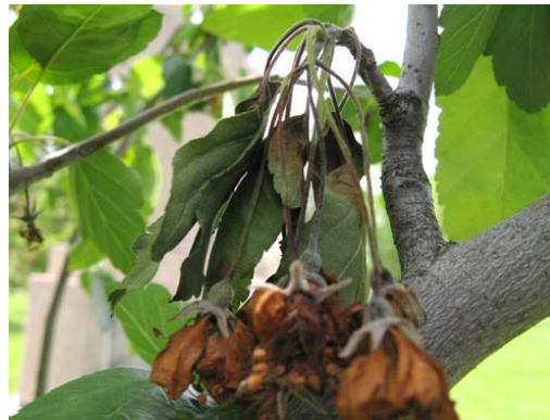
A newly infected branch with fire blight

Fire blight is especially damaging at times due to the rapid nature in which many trees decline and its prevalence in most areas of Utah, especially during wet, warm springs during flowering. Apple varieties such as Jonathon, Jonagold and Gala are extremely susceptible. Rootstock additionally influences susceptibility, where some are more resistant than others. Unfortunately, the consumer has little control over which rootstock a particular variety is grafted onto, especially when purchasing from local vendors and box stores. Some mail order catalogs list what rootstock the tree has been grafted onto or may even list more than one rootstock choice that may be ordered. With some research, this information can be useful for choosing rootstocks with desired characteristics. For further information concerning fire blight, access the following factsheet: http://extension.usu.edu/files/publications/factsheet/fire-blight-08.pdf . Information concerning varietal fire blight resistance can be found by variety in Table 1. Rootstocks with Geneva (or an abbreviation of the letter G) in the name are additionally resistant, but availability is limited. For more rootstock information see table 3.