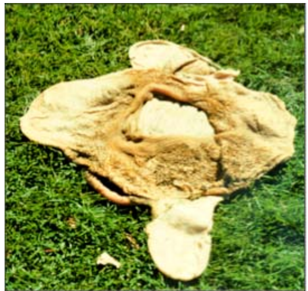
Figure 2. Rumens from lambs exposed to grain early in life (top) or no exposure (bottom).

with acidosis because they will eat grain readily even if their rumens are not ready to accommodate large quantities of concentrates (Ortega-Reyes et al., 1992). Animals will regulate intake of grain provided they are offered both concentrates and roughage and their rumens have time to adjust to large quantities of grain. Suggestions for preparing animal with experience eating grain to eat grain free choice are as follows: 1) If ample trough space is available, limit grain to the amount animals will eat in about 15 minutes then increase the amount of grain offered by 10% each day until animals have grain available at all times; 2) If ample trough space is not available, mix concentrates with chopped roughage so that animals will not over ingest