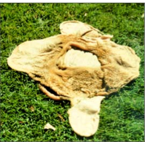
Figure 2 . Rumens from lambs exposed to grain early in life (top) or no exposure (bottom).

with acidosis because they will eat grain readily even if their rumens are not ready to accommodate large quantities of concentrates (Ortega-Reyes et al., 1992). Animals will regulate intake of grain provided they are offered both concentrates and roughage and their rumens have time to adjust to large quantities of grain. Suggestions for preparing animal with experience eating grain to eat grain free choice are as follows: 1) If ample trough space is available, limit grain to the amount animals will eat in about 15 minutes then increase the amount of grain offered by 10% each day until animals have grain available at all times; 2) If ample trough space is not available, mix concentrates with chopped roughage so that animals will not over ingest