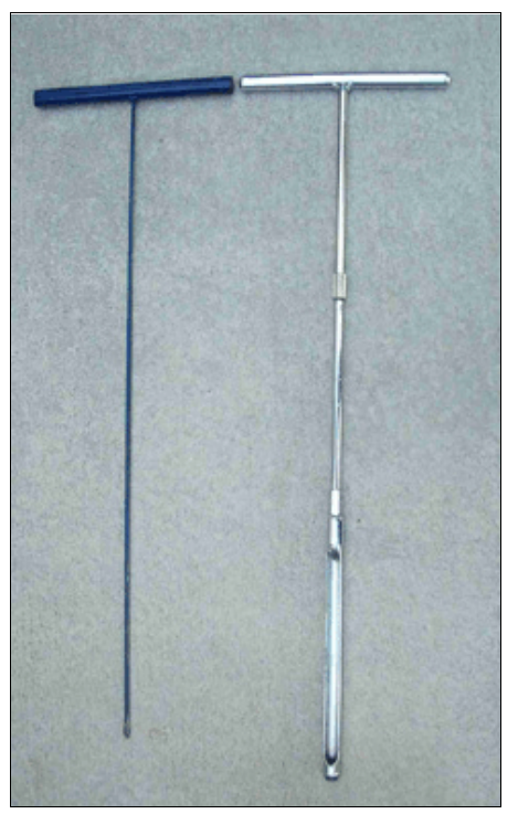
A tile probe (left) and soil probe (right)

Don't use probes in areas where utility lines are located, and use them carefully around sprinkler lines. If you don't know the location of utility lines contact your local utility company or Blue Stakes at 1-800-662-4111.