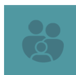
Family and Consumer Sciences