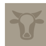
Agriculture and Natural Resources