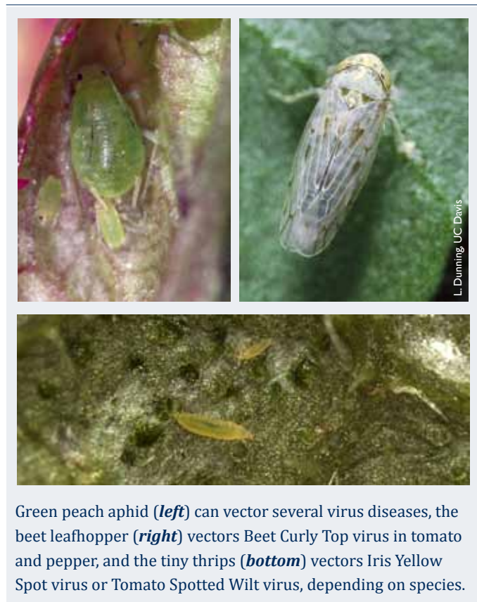
Green peach aphid ( left ) can vector several virus diseases, the beet leafhopper ( right ) vectors Beet Curly Top virus in tomato and pepper, and the tiny thrips ( bottom ) vectors Iris Yellow Spot virus or Tomato Spotted Wilt virus, depending on species.

The beet leafhopper vectors Beet Curly Top virus which is primarily a problem in tomato and pepper in Utah; how-