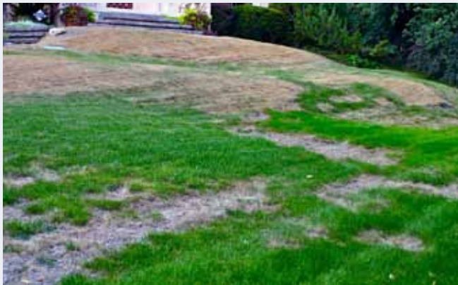
Chinch bug turf damage can be severe in hot, dry conditions, as happened in Utah in the summer of 2012.

under water. Keep a constant depth of water in the can for about 10 minutes by pouring in extra water to replace the lost/leaching water. Count the number of chinch bugs that float to the surface. Treatment threshold is about 20-25 bugs per square foot, or about 4-5 per can. If numbers are below this threshold, regular irrigation and fertilization can mitigate chinch bug damage.