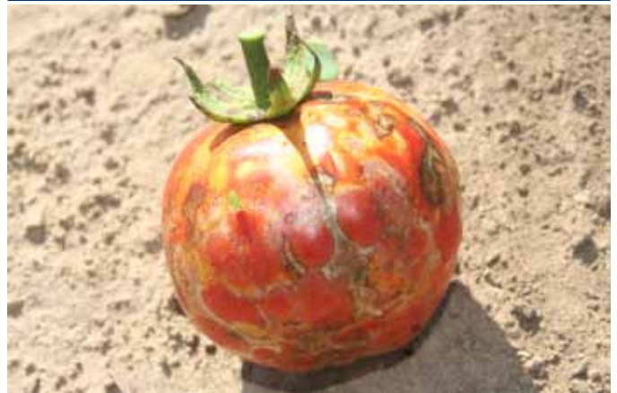
Tomato Spotted Wilt virus causes stunting, leaf necrosis, plant dieback, and fruit distortion (external and internal) including ringspots.

There are three primary species of aphids that occur on vegetables in Utah: green peach aphid, potato aphid, and melon aphid. These aphids can vector Watermelon Mosaic virus, Pepper Mottle virus, Alfalfa Mosaic virus, and others. Reflective mulches have been shown to reduce early-season aphid populations, and insecticides with good aphid-killing activity, including horticultural mineral oil and insecticidal soap, can reduce the incidence and spread of aphid-vectoring viruses. There are resistant or tolerant cultivars for some crops and viruses. Good weed control and separating fields of susceptible crops have shown some success for cucurbits. There are many natural predators and parasitoids of aphids; however, because the virus can be spread quickly and early in the season, reliance on biological control is often inadequate for virus prevention.