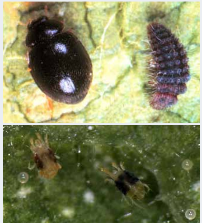
The Stethorus lady beetle (aka the spider mite destroyer, top ) is one of many important mite predators. Both the small adult (left) and larva (right) are predators of spider mites ( bottom ).

Mite management needs to be proactive and preventive. Strategies include conservation of mite predators by avoiding broad-spectrum insecticides, correct identification of the pest mite, monitoring the mite’s population growth, and using action thresholds when available. Dust buildup on