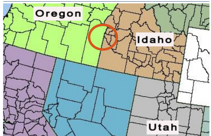
Circled area is where elm seed bugs have been confirmed.