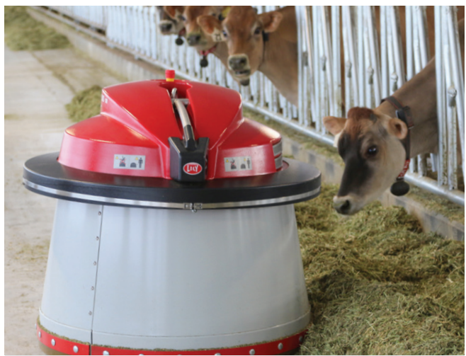
Robotics at the Caine Dairy go beyond the milking process and are also used to push feed to the cows.

The dairy industry is important for Utah’s economy; however, it has changed considerably over the years. The number of dairy cows has stayed at approximately the same level for at least 30 years, but the number of dairies has significantly declined at an accelerated rate over the past 2-3 years. This means that dairies are fewer and much larger. As dairies get larger, there is an increased emphasis on “managing” a dairy. This means more emphasis on evaluating how the dairy is performing and how to fix problems.