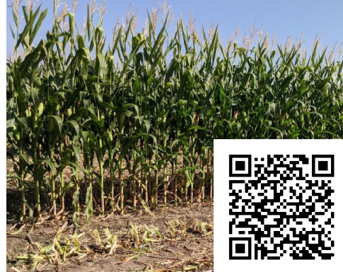
Drought tolerant corn