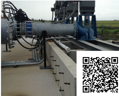
Variable frequency drives