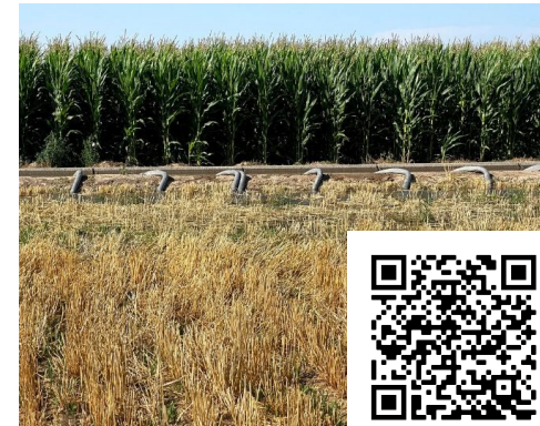
Irrigation system efficiencies